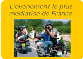
L'évènement le plus médiatisé de France